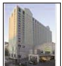
Ritz Carlton Arlington, Virginia

The 2nd Annual Washington Briefing and Council Meetings will be held November 6-7. Watch TRALA's website and email for your invitation. Plan to attend this outstanding networking opportunity in the nation's capital!