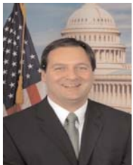
Congressman Chris Carney (D-PA)

With transportation security at the top of the federal government and the industry’s agenda, Congressman Chris Carney (D-PA) met and spoke with TRALA’s Executive Committee during its annual meeting in Washington, DC on June 13.