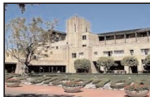
Arizona Biltmore Resort & Spa Phoenix, Arizona